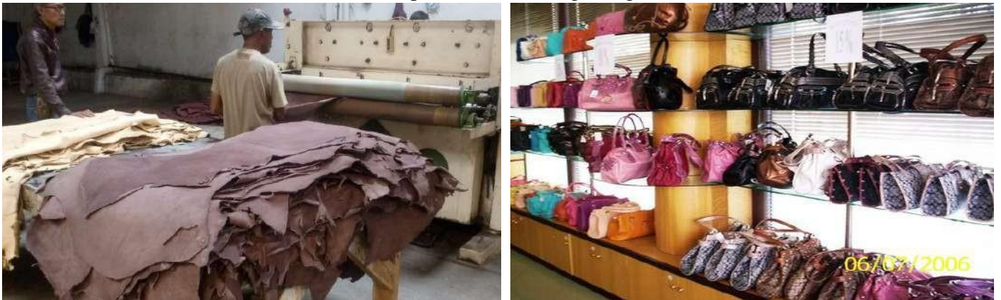
Sukaregang shop and leather industrial