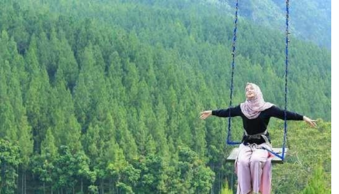
The Lodge Lembang