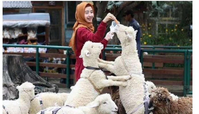
Farm House susu Lembang