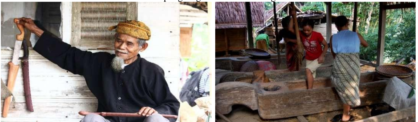
Local people of Naga Village