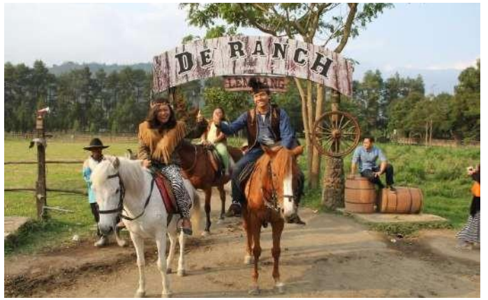
The Ranch Lembang