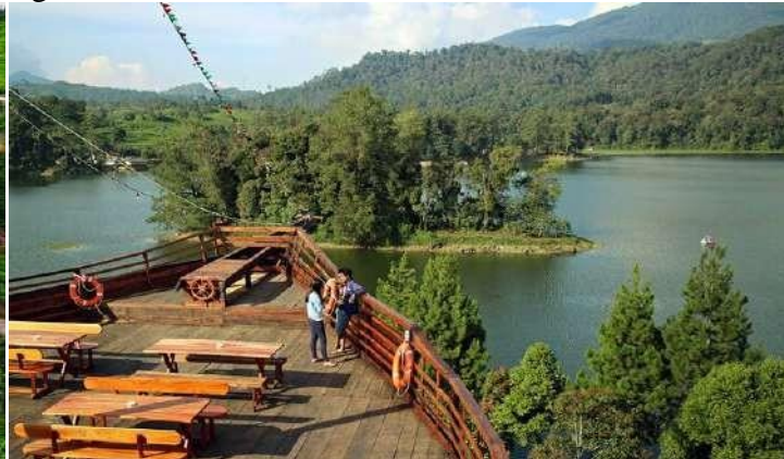
Glamping Lakeside Restaurant