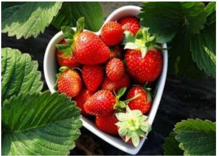
Strawberry Plantation Ciwidey