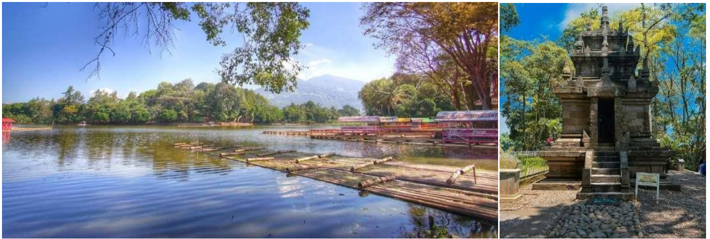
Temple & lake of Cangkuang