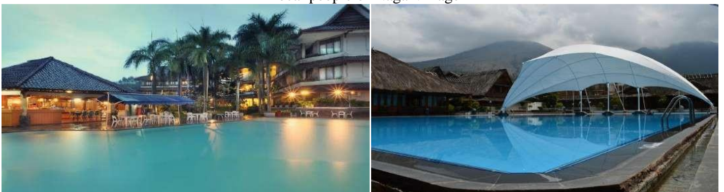
Tirta gangga hotel hot spring or Sumber alam resort hot spring