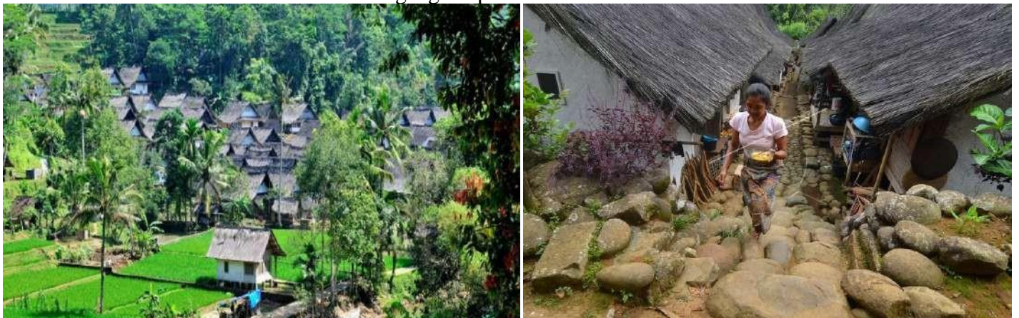
Kampung Naga Traditional Village